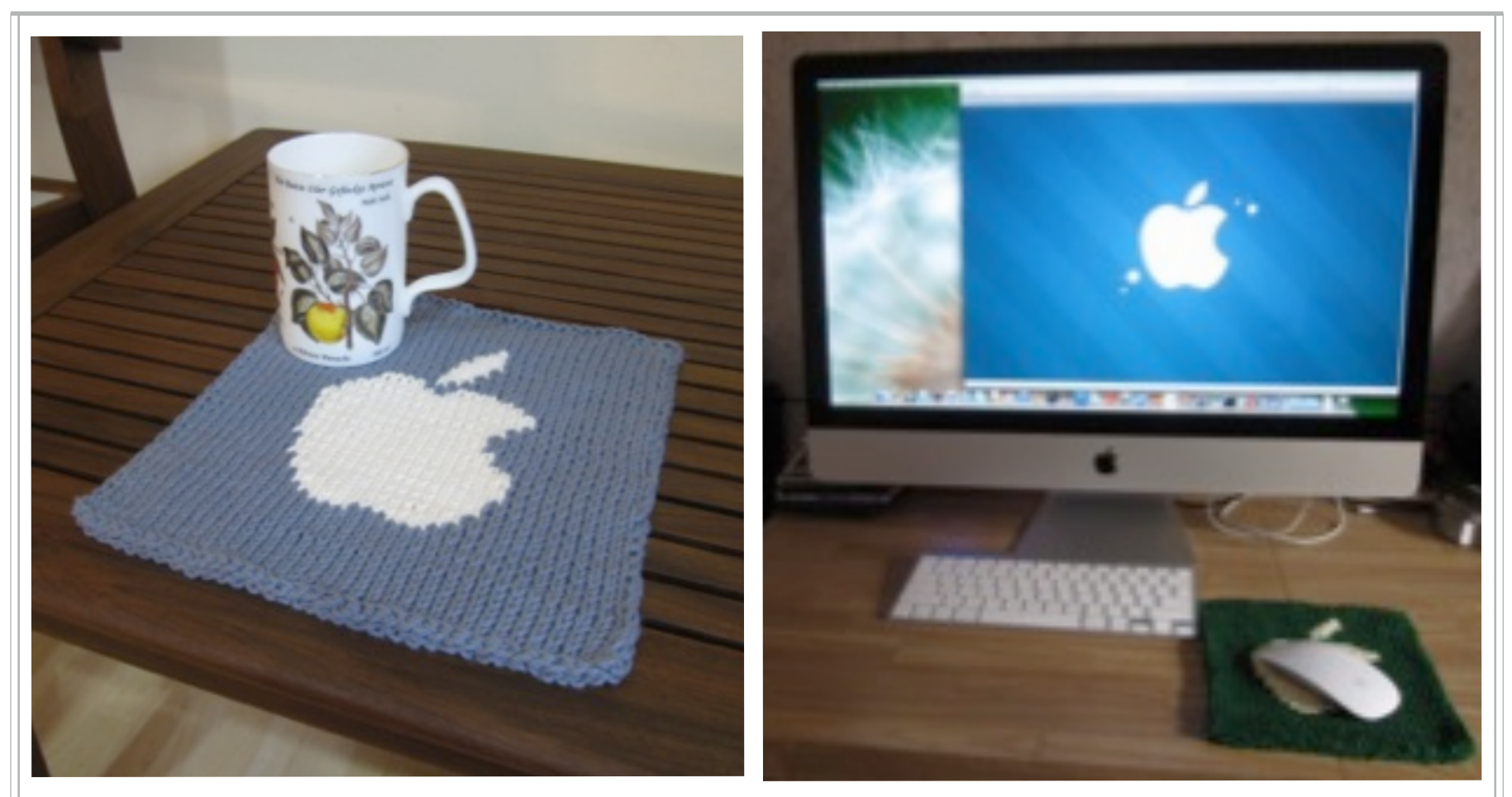
This Apple Mousepad and Coaster is one of knitvana Art Knitting patterns. The size of it is (10'' \times 10'')